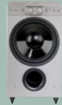
Recommended subwoofer (optional) AS-P300/AS-P400

A STYLE THAT'S ALL YOUR OWN... athena TECHNOLOGIES™ POINT5 MK II sound system has also been intuitively designed to let you create your own style. Complement your décor with the sleek, sophisticated styling of a silver baffle with a high gloss black finish. If you select the components separately, black baffles are available. And because these speakers are magnetically shielded, you can place them virtually anywhere you like. Want to take performance even further? The S.5 satellites from this system can be used as rear channel speakers with athena's SCT™ (System Creation Technology) series. Exceptional sound performance to suit your senses, style and budget. That's the point of POINT5 MKII.